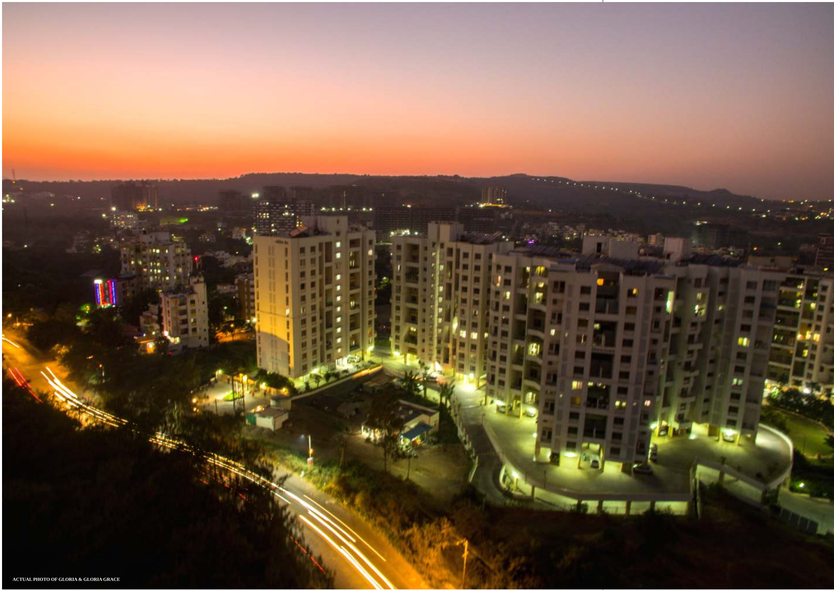
ACTUAL PHOTO OF GLORIA & GLORIA GRACE