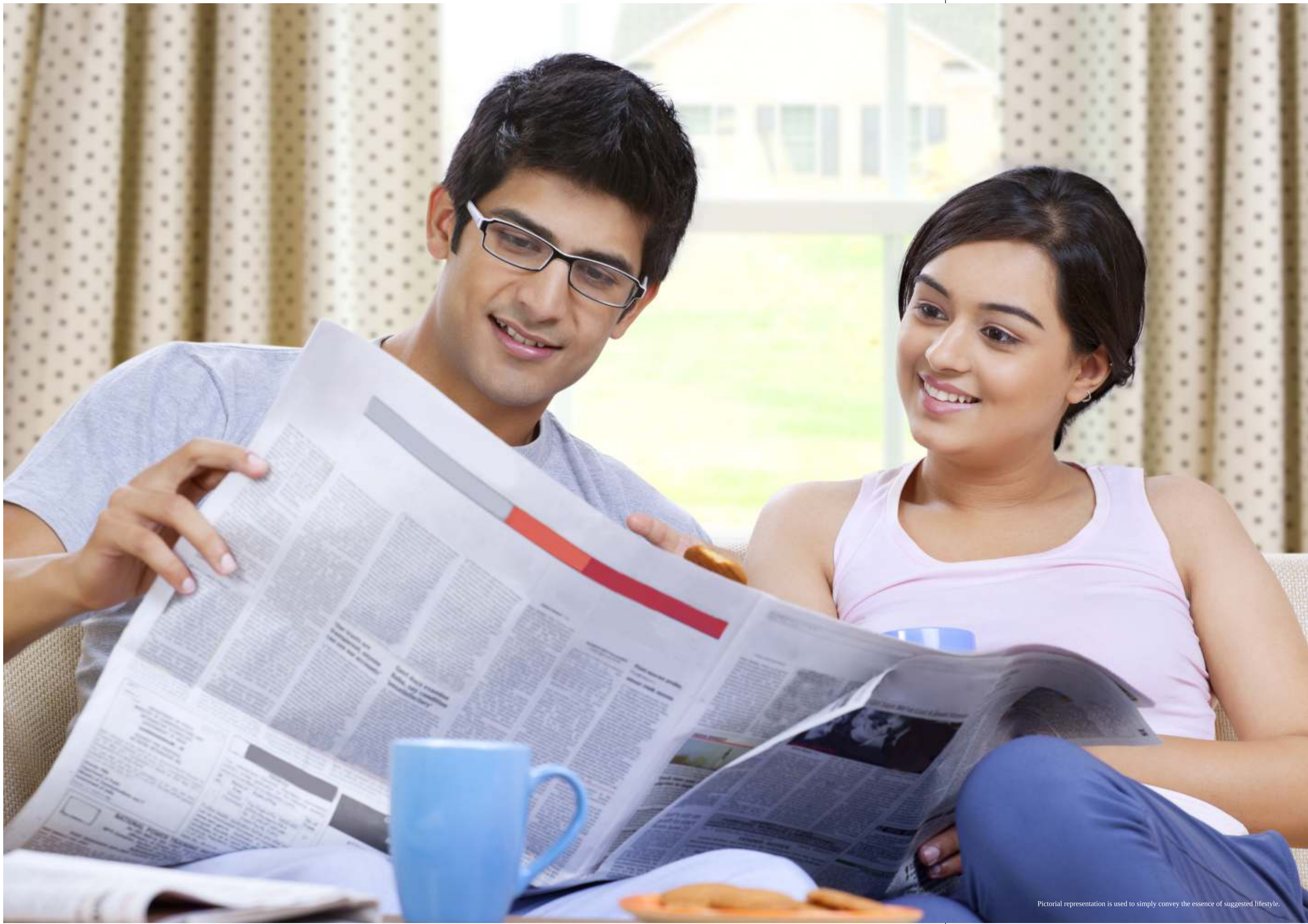
Pictorial representation is used to simply convey the essence of suggested lifestyle.