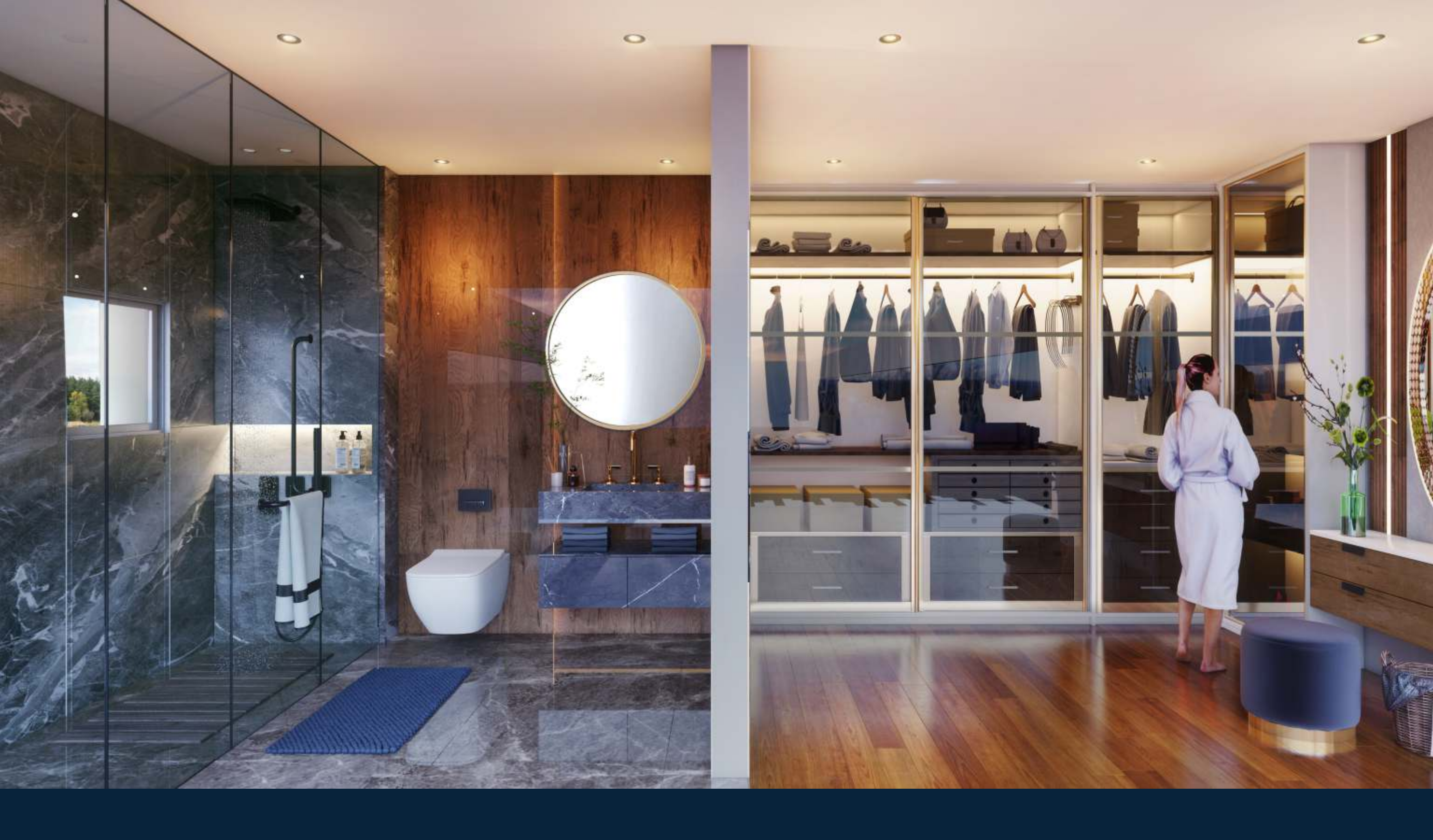
BATH & WALK-IN WADROBE