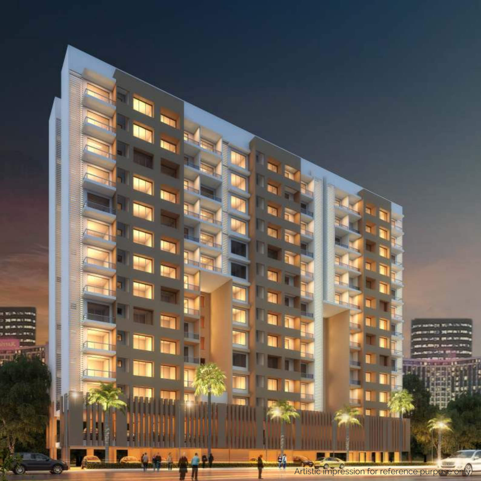
Artistic impression for reference purpose only.